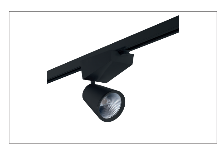
Light. For Generations.