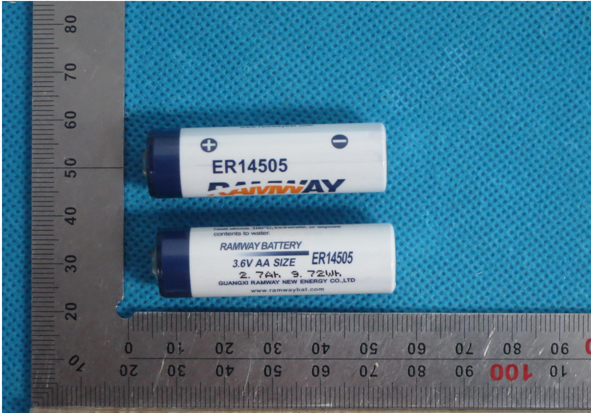
鑫宇环仅对原报告照片中的样品负责 AGC authenticate the photo on original report only

The results shown in this test report refer only to the sample(s) tested unless otherwise stated and the sample(s) are retained for 30 days only. The document is issued by AGC, this document cannot be reproduced except in full with our prior written permission. The document is available on request and the brief information for its validation can be assessed and confirmed at http://www.agc-cert.com