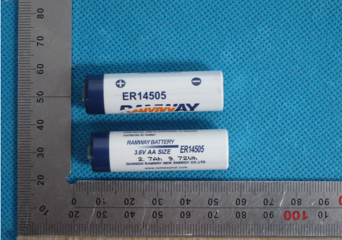
鑫宇环仅对原报告照片中的样品负责 AGC authenticate the photo on original report only

The results shown in this test report refer only to the sample(s) tested unless otherwise stated and the sample(s) are retained for 30 days only. The document is issued by AGC, this document cannot be reproduced except in full with our prior written permission. The document is available on request and the brief information for its validation can be assessed and confirmed at http://www.agc-cert.com