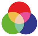
Mischfarben werden mit der Ansteuerung mehrerer Eingänge gleichzeitig erreicht. / Mixed colours will be achieved with the control of multiple inputs simultaneously.