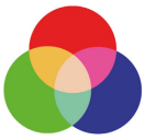
Mischfarben werden mit der Ansteuerung mehrerer Eingänge gleichzeitig erreicht. / Mixed colours will be achieved with the control of multiple inputs simultaneously.