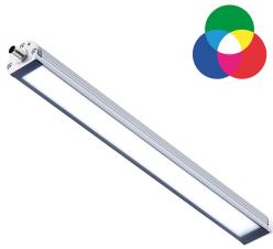
Darstellbares Farbspektrum / Displayable colour spectrum