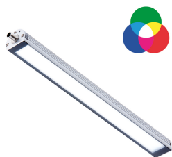
Darstellbares Farbspektrum / Displayable colour spectrum